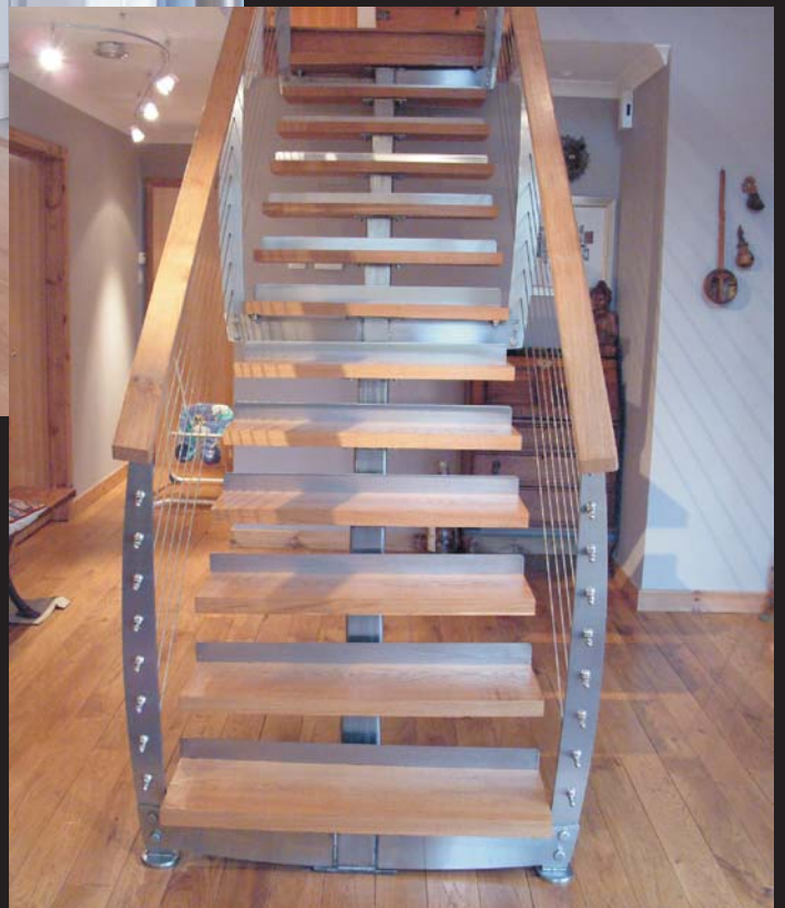
Single stringer - central support