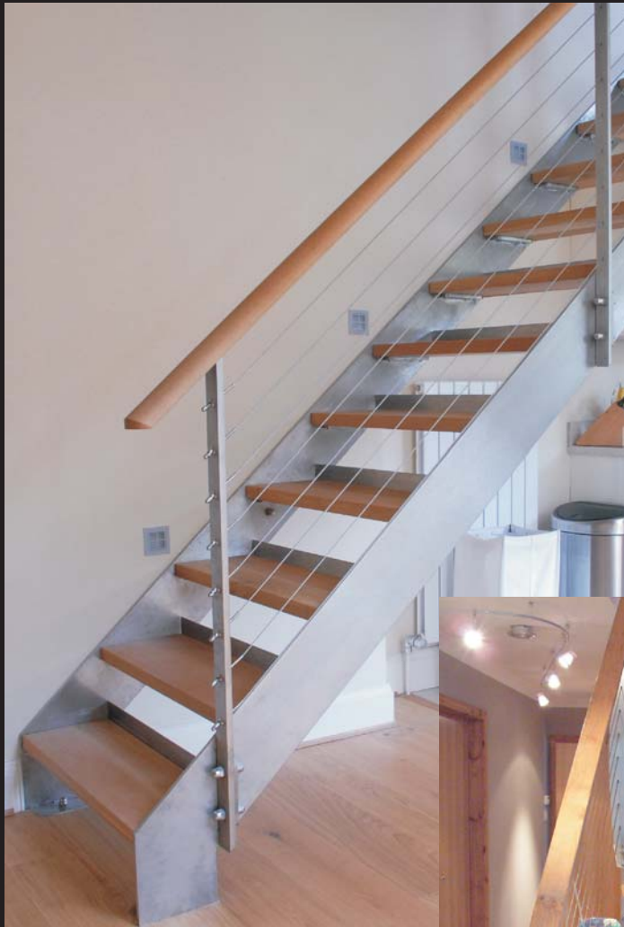
Double stringer - side supports

The basic feature of a staircase is the main support or stringer. This can be designed as two side supports, a single central stringer, or, if your building suits, potentially your stair could be adapted to existing features.