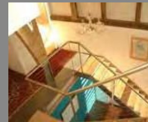
GRAND DESIGNS PROJECT KILCREAGAN ARGYLL