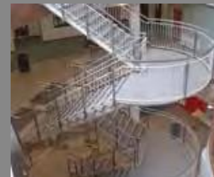
REID KERR COLLEGE PAISLEY