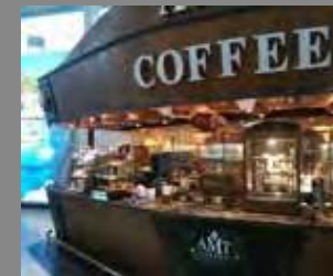
AMT COFFEE EDINBURGH