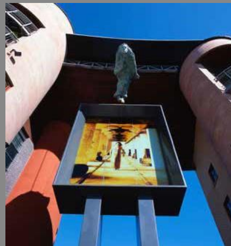
GORBALS ART PROJECT GLASGOW